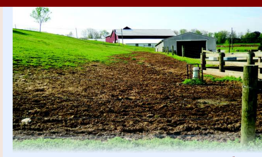
Animal Heavy Use Areas like these need Best Management Practices (BMPs).

Contact your County Conservation District, local USDA Natural Resources Conservation Service (NRCS) office, a qualified private consultant or your PA Department of Environmental Protection Regional office for more details.